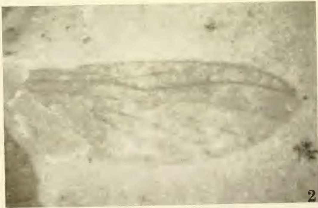
Figs. 1-2. Plecia akerionana , photograph of holotype: 1, habitus; 2, wing.